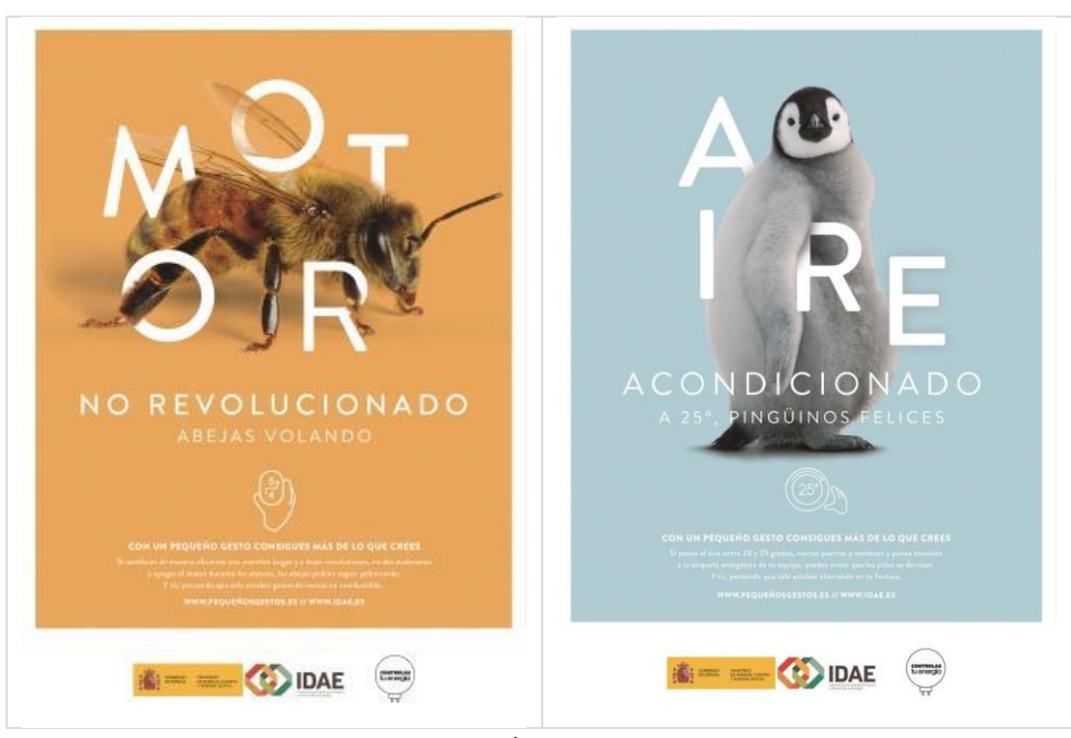
Figure 2. IDAE advertising campaigns.

The link to one of the communication campaign programmes is indicated here: https://www.idae.es/informacion-y-publicaciones/campanas-y-acciones-de-comunicacion