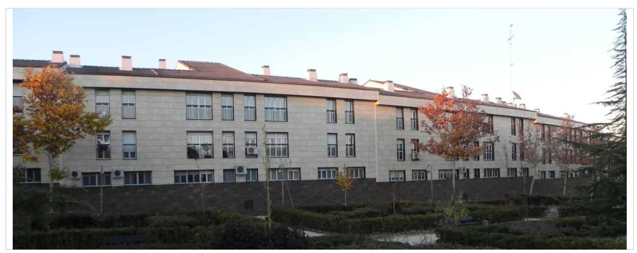
Figure 7. "Oscar" building in San Sebastián de los Reyes (Madrid) after rehabilitation.

This project has had a total cost of 1.06 million € and has received a subsidy of 240,000 €.