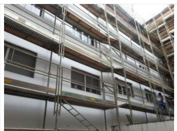
Figure 6. Renovation works "Oscar" building in San Sebastián de los Reyes (Madrid).

The building was constructed in 1991 under a 1979 regulation for thermal insulation; with assistance from the programme for the energy renovation of existing buildings, PAREER-CRECE of the IDEA, 80 millimetres of expanded polystyrene insulation was installed. All windows were renovated and now achieve